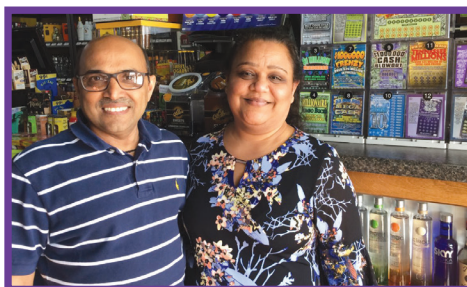
Patel Wine & Spirits Spring Hill, TN

Additionally, in-store promotions and new product launches help create excitement for your customers.